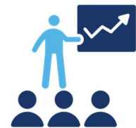
Final interview with the Managing Partner

We review all applications we receive, and seek out individuals who can demonstrate insight into their experiences. Interviews for training contracts will take place in March & April 2026. Candidates will attend an assessment and interview with partners and senior associates. The offer of a training contract is conditional upon the provision of satisfactory references.