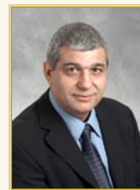
Offer Baruch Former Israeli Shin Bet Terrorism Expert