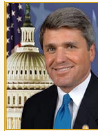
Honorable Michael T. McCaul United States Representative, 10th District, Texas