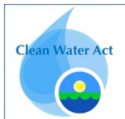
CWA § 404/401