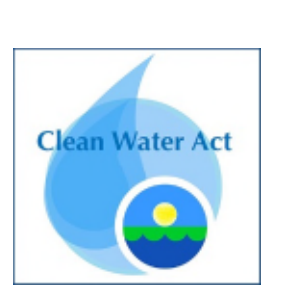
CWA § 404/401